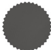
563 basalt grey