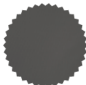
563 basalt grey