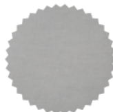
588 grey sunbrella®