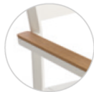
optional teak arm